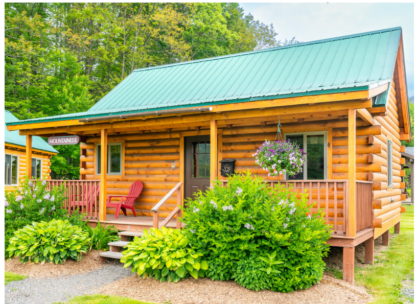
the Mountaineer 564 Sq. Ft. • 16x24