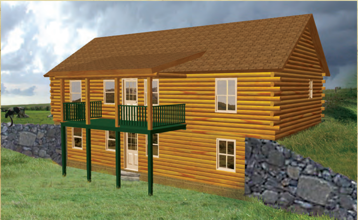
Artist rendering may vary from actual design.