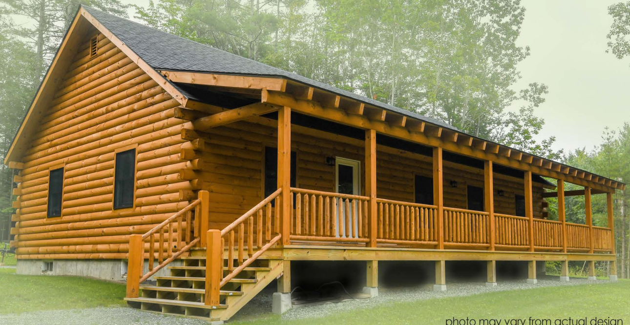
photo may vary from actual design